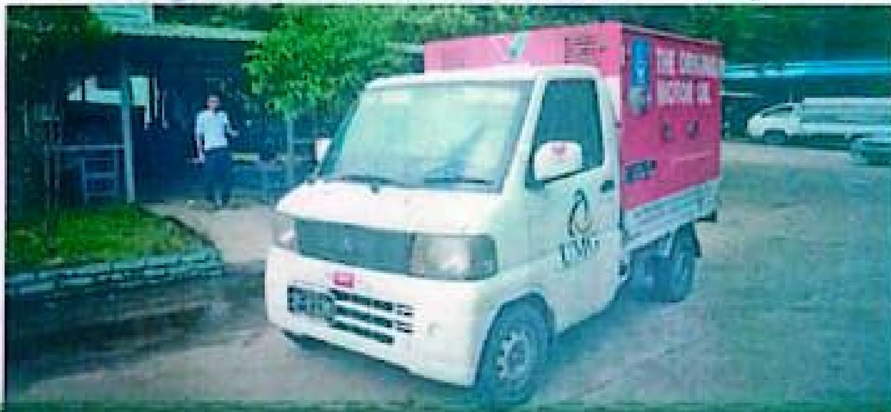
Plate No 2F/8336 Model Year 2004 Make & Model MITSUBISHI MINICAB U62T Vehicle Type VAN(4X4)(R) Location Y2