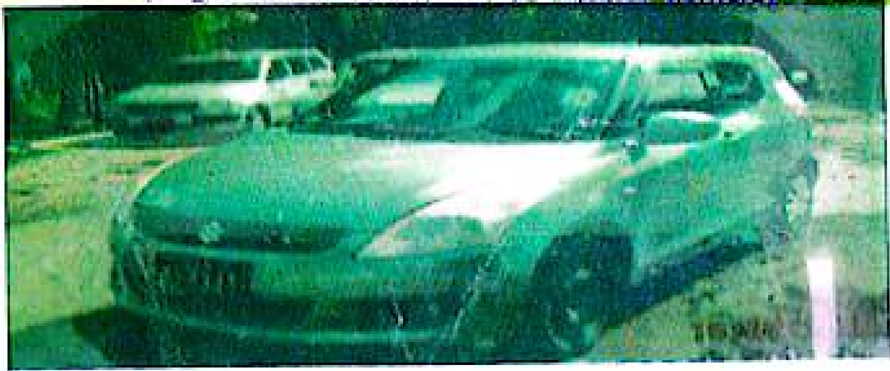
Plate No 4D/8341 Model Year 2010 Make & Model SUZUKI SWIFT ZC72S Vehicle Type HATCH BACK(4X2)(R) Location Y