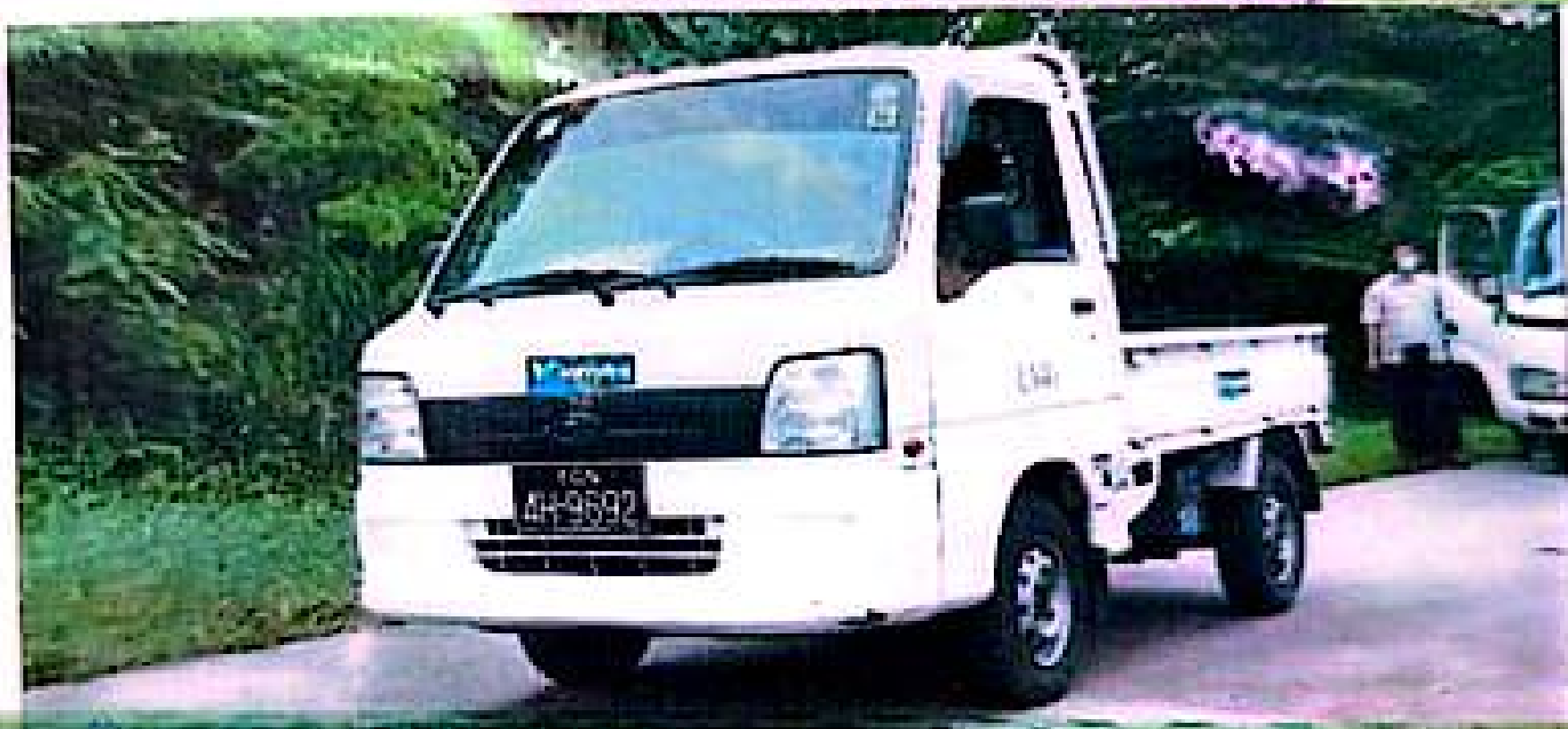
Plate No 4H/9692 Model Year 2006 Make & Model SUBARU SAMBAR TT1 Vehicle Type PICKUP(4X2)(R) Location Y2