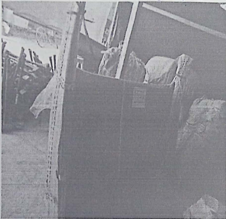
Front Bumper (unpainted)