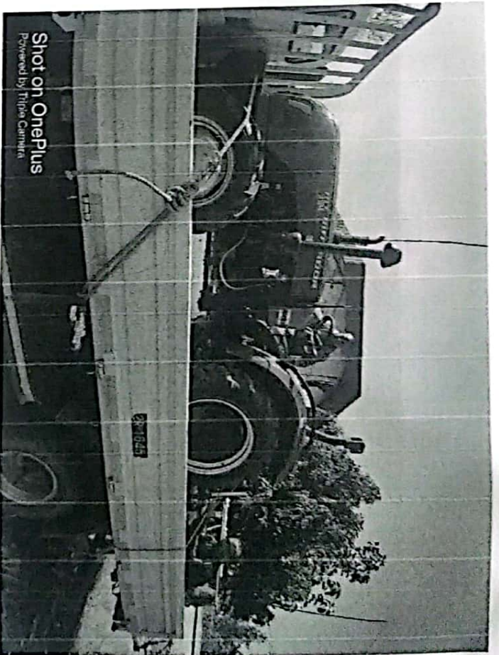
Shot on OnePlus Powered by Triple Camera