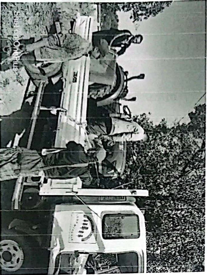
Shot on OnePlus