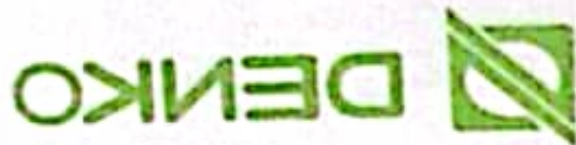
Plate: LC 1F8231