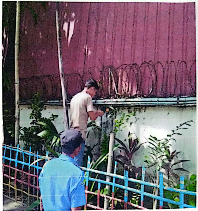
( Check point ခုံကြို (၇၂၄၅၅) တပ်စခန်း၌ )